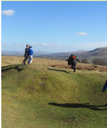
Pupils enjoying a walk near Pen y Fan.

For more information about the Authority's Education Service see: http://www.beacons-npa.gov.uk/learning/