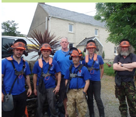
Upland Path Volunteers after brush cutter training

The training will enhance the already valuable contribution these volunteers make to the conservation of the upland environment.