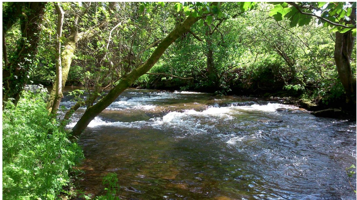
River Usk, Sennybridge