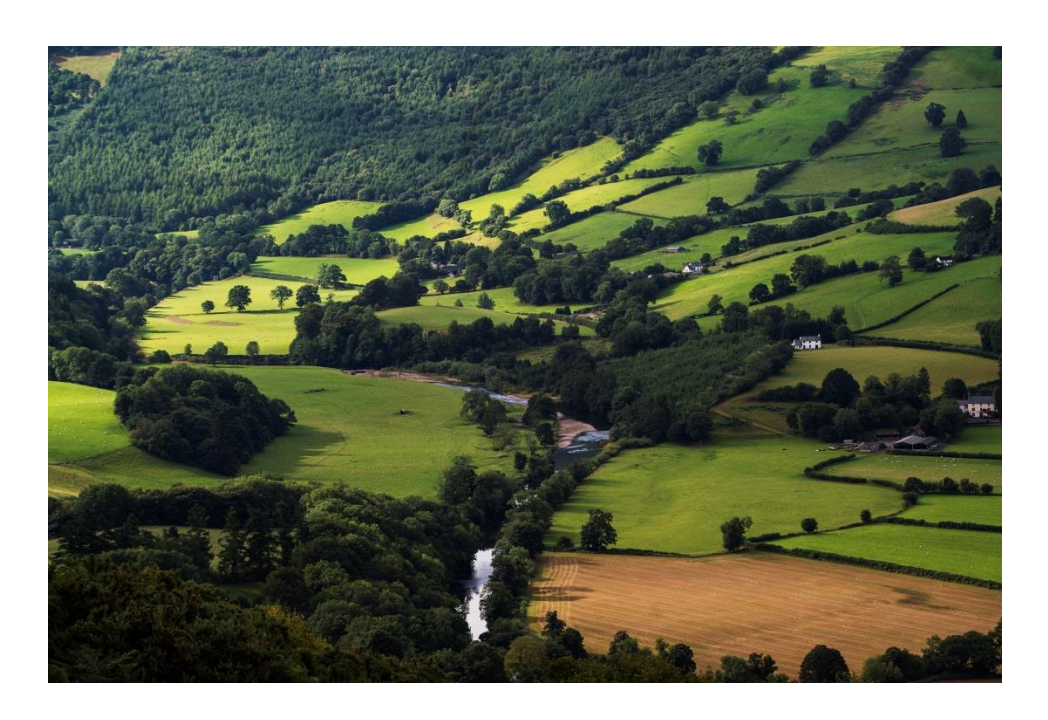
River Usk near Talybont