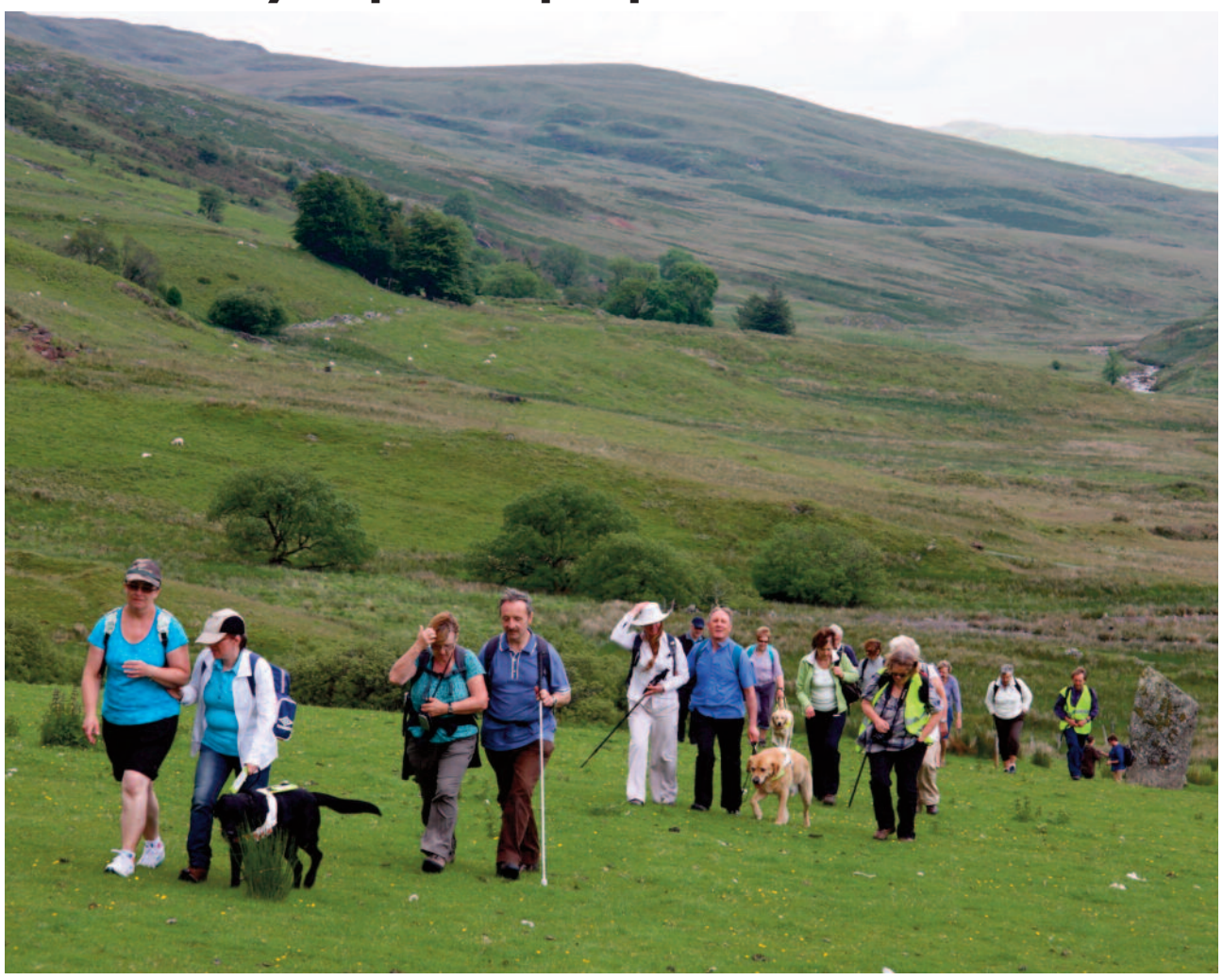
'The walk is the highlight of my month!'

The scheme is now in its ninth year and was initiated at the Eryri Disability Equality Forum, when a blind member mentioned the lack of countryside walking opportunities for blind and visually impaired people. Monthly walks vary between 3 and 7 miles. In 2014 the group climbed Snowdon. Club Members are recruited through the Guide Dogs Society and North Wales Society for the Blind who provide training on visual awareness and guiding. The project aims to improve participants' physical and mental health and wellbeing. "There is no price you can put on the freedom to walk without fear" (One of the participants)