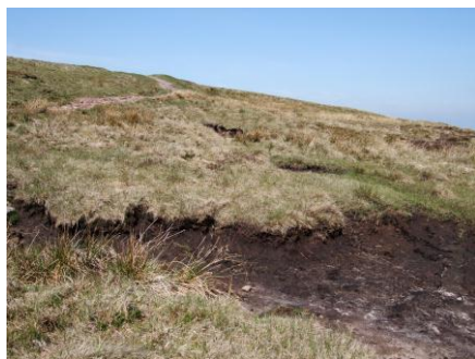
Peat Erosion, Twmpa, Black Mountains.