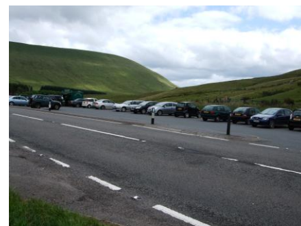
Upland car park, Storey Arms