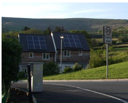
Eco-friendly housing, Crickhowell