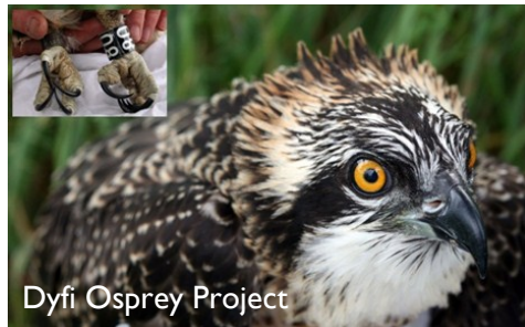
Dyfi Osprey Project

For advice on householder developments and general enquiries. Every Wednesday from 9.30am with last appointment 11.30am at the National Park Offices, Brecon. Appointments are available in 30 minute slots and must be booked in advance. Please call 01874 620431