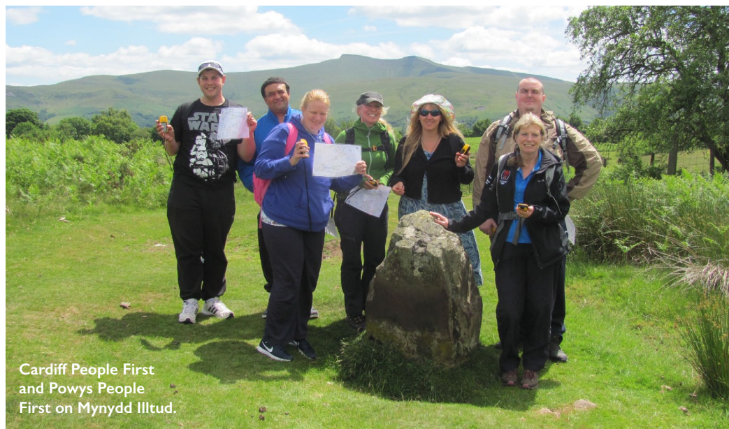
Cardiff People First and Powys People First on Mynydd Illtud.

If you would like to be placed on our mailing list or contribute to future editions, please be sure to contact the Communities Team via the A-Z of services at the end of this newsletter. This newsletter is also available online at http://www.beacons-npa.gov.uk/communities/community-newsletter/