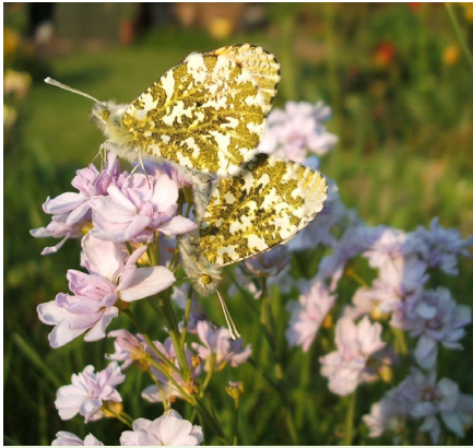
Mating orange tip butterflies.