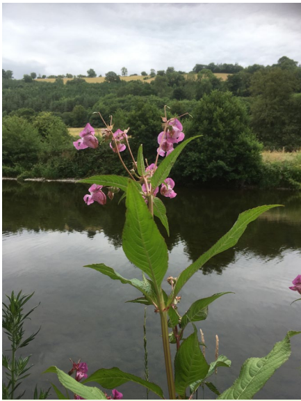
Himalayan Balsam at Island Fields, Brecon.