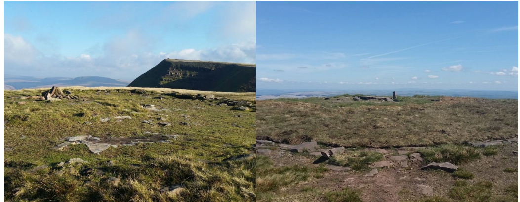
Fan Foel before conservation work Spring 2017. Fan Foel after the work Spring 2018.