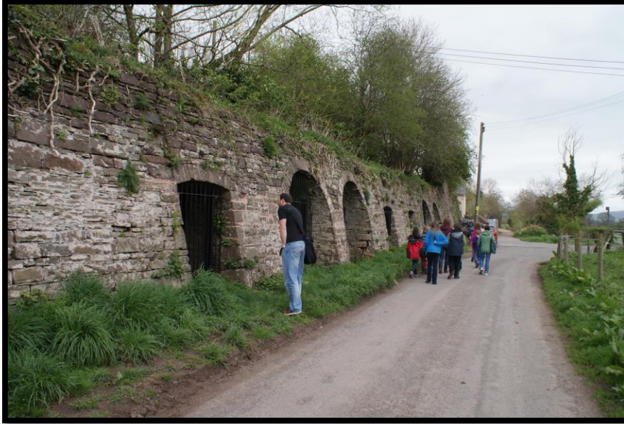
Young Archaeologists Club visit to Watton Lime Kilns, Brecon