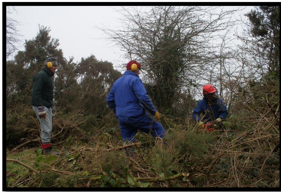
Allt yr Esgair