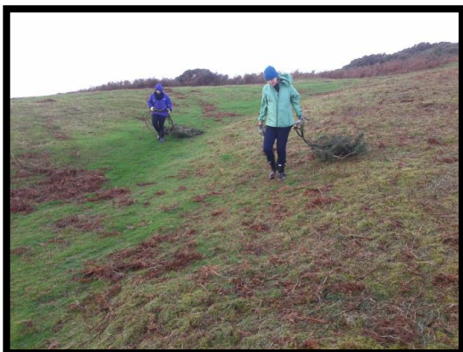
Pen y Crug, Brecon