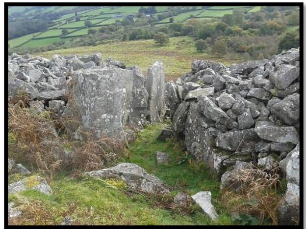
Postern entrance at Y Gaer Fawr, Garn Goch Iron Age Hillfort, near Llandeilo

Historically, BBNPA has carried out significant (and continues to do so) work with the Dyfed Archaeological Trust (DAT) giving advice on the CALCH (lime kilns) in the west of the Park. At Carreg Cennen Castle DAT provided a weekend event, weekday schools events and have delivered events in partnership with DAT and the Geopark that focus on British Archaeology week.