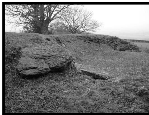
Scrutiny Panel’s site visit to Penyrwlodd Burial Chamber, near Talgarth