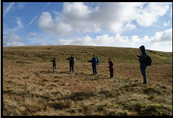
Y Pigwn, near Trecastle Site of Roman Marching Camp

partners, funded by ERDF money through Cadw, and the Development of a mobile application for Y Pigwn and Garn Goch.