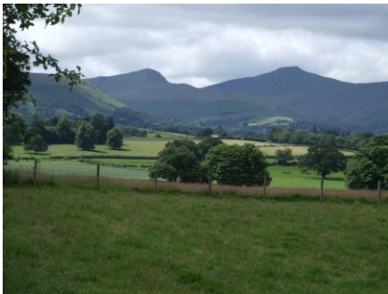
Pen Y Fan with farmland and parkland in the foreground

Principle ecosystem services include pasture and arable farming (food provisioning), woodlands and fresh water. The River Usk provides food and recreation services including fish, angling, watercraft and access to water. In common with the rest of the National Park, this LCA also contributes to cultural services such as spiritual enrichment, cultural heritage, recreation and tourism, and aesthetic experiences. Main Green Infrastructure assets include the River Usk corridor, the extensive mix of coniferous and deciduous woodland stands, Traeth Mawr Nature Reserve, the Taff Trail, and visitor attractions including Brecon Cathedral and the Roman fort at Y Gaer.