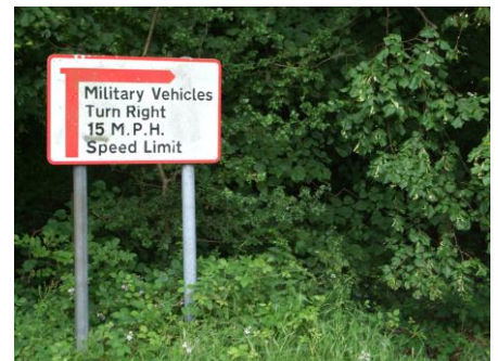
Sign for military vehicles using rural lane south of Brecon