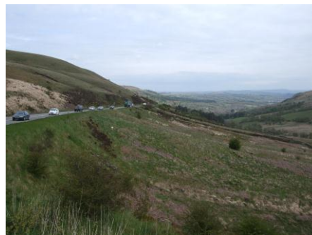
The A470 through Glyn Tarell