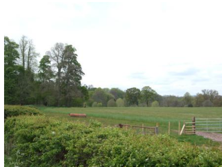
Penpont Parkland in the Usk Valley