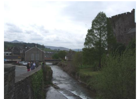
Brecon Castle and town with the Central Beacons beyond