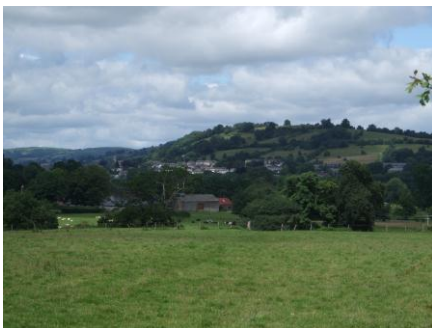
Development on edge of Brecon expanding up the hillside