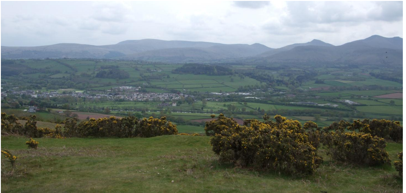
View of Brecon town and the Central Beacons from Pen-y-crug Hillfort

This is an area of transitional landscape, connecting the uplands of the Central Beacons with the lower and more settled Usk Valley. It is visually dominated by the high northern scarps of the Central Beacons which form a dramatic southern backdrop to the area. A generally pastoral agricultural landscape of green fields divided by hedgerows, its character is also locally influenced by upland heath, designed parklands, urban development, valley floodplain and transport routes. A landscape of historical strategic importance, it contains defensive sites from the Iron Age, Roman and Medieval periods, and as well as recent military use.