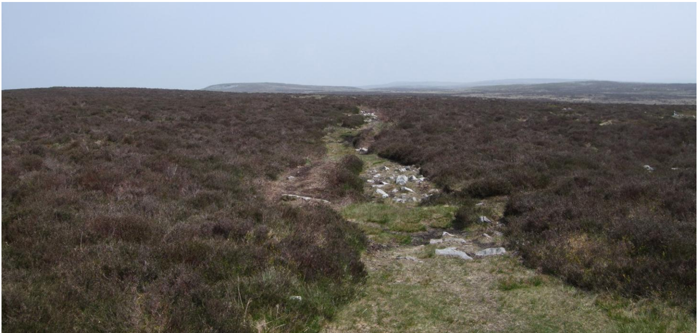
Heather moorland near summit of Mynydd Llangynidr

This LCA comprises an elevated plateau of moorland, characterised by its openness, smooth profile, lack of settlement, prehistoric archaeology and quarrying legacy. It contains many features of a karst (limestone) landscape, and a mosaic of high-quality moorland habitats. Despite its proximity to settlements, much of the area retains an open, undeveloped quality and is not heavily used for recreation although it has been used recently as a set for various films and TV programmes, Its crags and moorland also provide a dramatic and seasonally-changing backdrop to surrounding lower land including the Usk Valley.