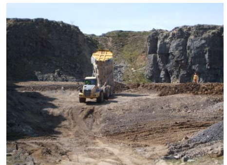
Infilling at Cwar Blaen-dyffryn