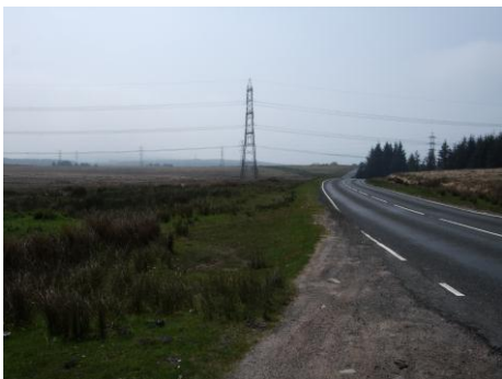
Pylons, plantation etc. at southern boundary of National Park