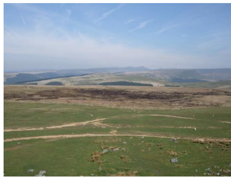
Informal kart track near Cwar yr Hendre, with eroded peat bog in the middle distance, and the Central Beacons on the horizon.