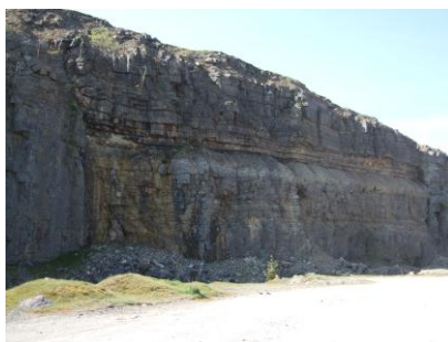
Quarry face showing interbedded limestones and sandstones (also a nesting site for Peregrine Falcons).