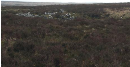
Prehistoric Cairn in heather moorland landscape near the summit of Mynydd Llangynidr.

Main Green Infrastructure features are the open access to uplands, numerous small watercourses and lakes, and the Craig y Cillau National Nature Reserve. The Usk Bat Sites SAC provides Green Infrastructure for bat species.