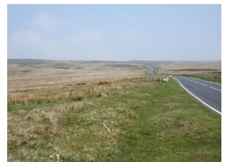
Limestone grass moorland and road used in the filming of TV series 'Torchwood'.