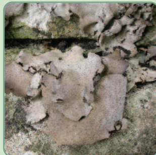
Dermatocarpon miniatum is a scarce species of lichen that grows on limestone rocks and is easily dislodged.