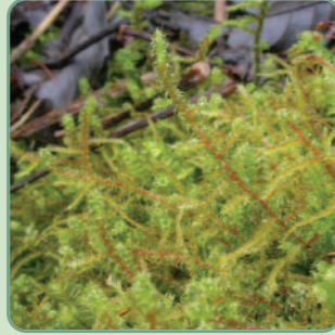
Rhytidiadelphus subpinnatus (Scarce Turf-moss) Waterfall Country is the British stronghold for this nationally rare species. It tends to grow in vulnerable places such as just above the floodzone by rivers and by footpaths.

The South Wales Outdoor Activity Providers Group, BBNPA, FCW and the Countryside Council for Wales (CCW) are working together to minimise the impact of gorge walking whilst still allowing it to continue. It has been agreed that gorge walking should be focussed in the Craig y Ddinas/Afon Sychryd area and the Code of Conduct shown overleaf aims to minimise the impact of the activity and allow damaged areas to recover. Monitoring will be put in place to measure the effectiveness of this code.