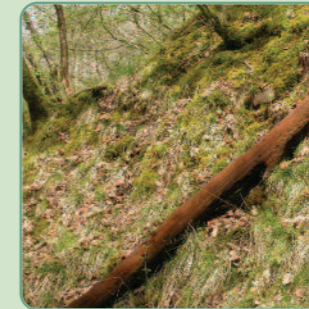
Nowellia curvifolia (Wood-rust) Large logs that fall on the woodland floor are very important for a range of bryophytes, invertebrates and fungi. This log is a red colour due to the abundance of the tiny liverwort.