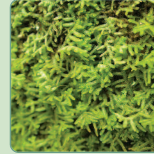
Lepidozia cupressina (Rock fingerwort) This uncommon species is at the southern edge of its British range in the Waterfalls area.

In the woodlands, pressure from gorge walking groups (as well as the general public) can damage vegetation and prevent it recovering, eventually resulting in soil erosion. If bare rock is exposed, then the woodland may lose its ability to regenerate. Therefore group management in the woodlands, particularly when accessing the gorge, needs to be carefully planned and executed. If managed responsibly however, further damage can be avoided and habitat that has already been affected can be restored to its former glory. The map overleaf gives details of the access/egress routes that have been agreed - please help protect the area by avoiding other paths.