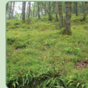
Lepidozia cupressina (Rock fingerwort) This uncommon species is at the southern edge of its British range in the Waterfalls area.